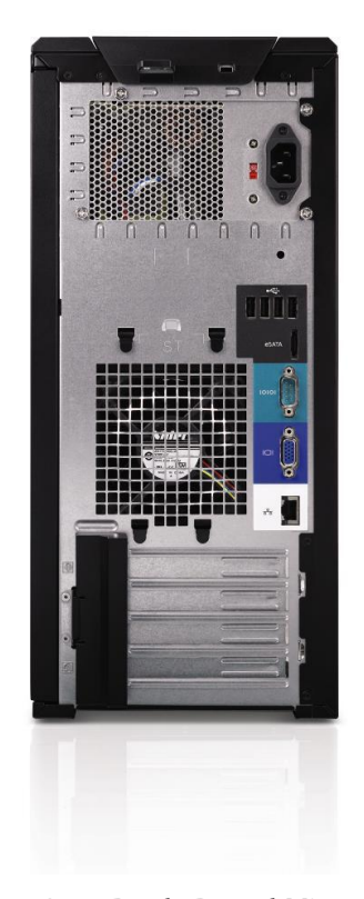
Figure 3. Back-Panel View

Figure 3 shows the back-panel view of the PowerEdge T110 II.